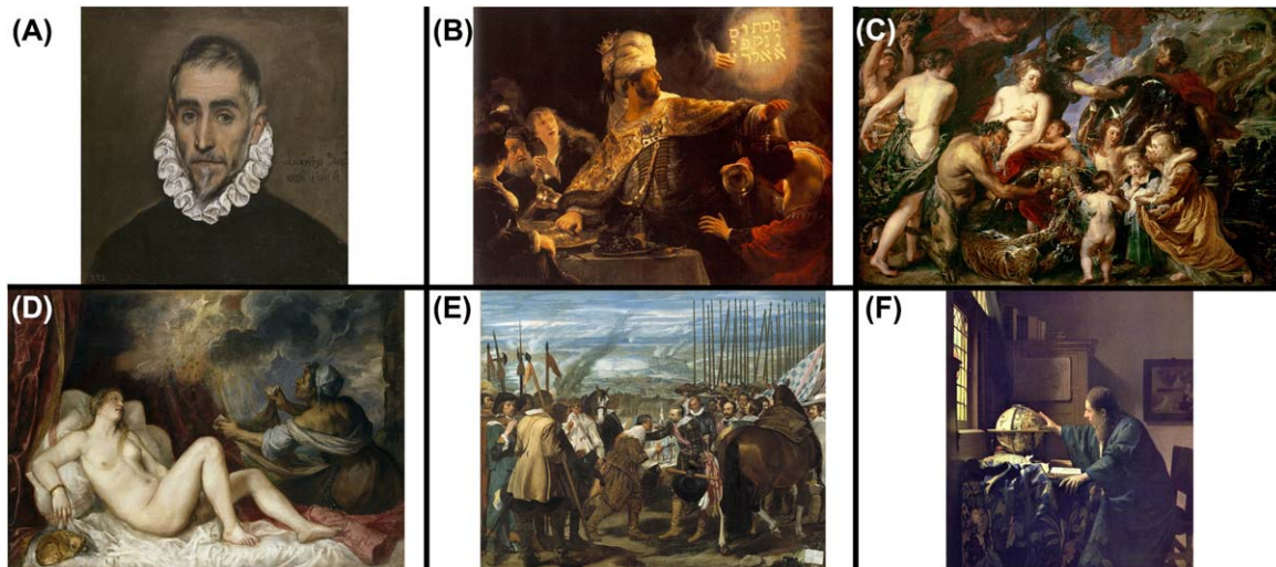
FIGURE 1 Examples of the images used in this work: A, An elderly gentleman (El Greco, 1600). B, Belshazzar's feast (Rembrandt, 1635). C, Peace and War (Rubens, 1629). D, Danaë with Nursemaid or Danaë Receiving the Golden Rain (Titian, 1560). E, The surrender of Breda (Velazquez, 1634). F, The Astronomer (Vermeer, 1669) [Color figure can be viewed at wileyonlinelibrary.com ]

We are not aware of the conditions in which they were captured, processed, and transmitted. However, we consider that they can satisfy the demands of our work, since we do not intend to carry out the exhaustive colorimetric characterization of the same, but a global comparative study of the chromatic gamuts in the paintings of the different authors. A strict colorimetric study would imply to have hyperspectral images of the paintings in order to calculate the chromaticity coordinates pixel to pixel under different illuminants. Such a